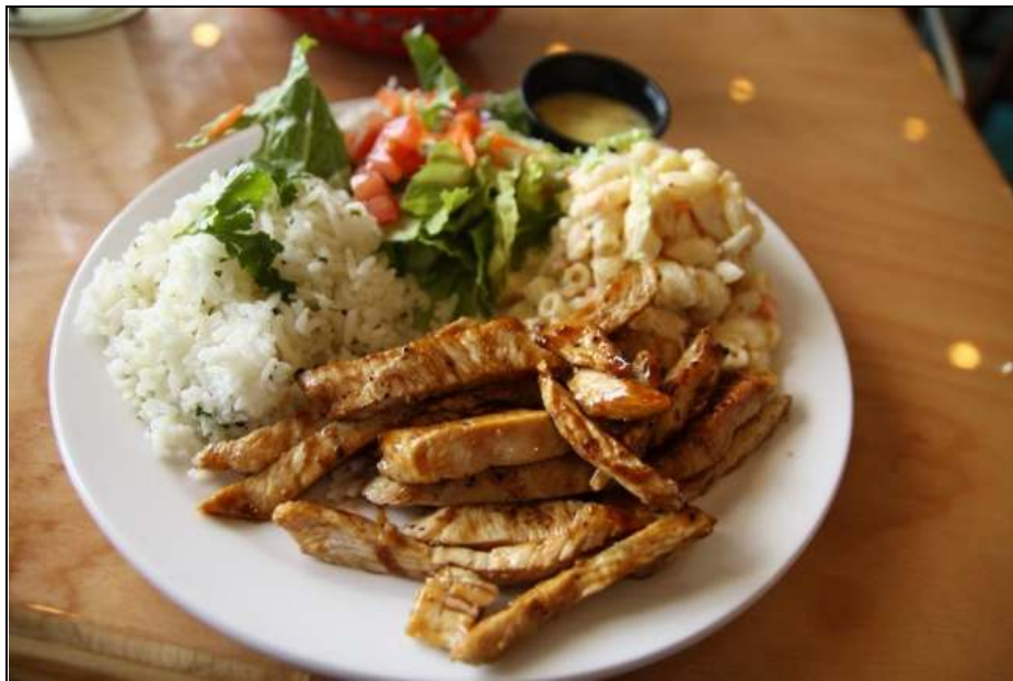
The Pillbox Plate

I love the beach as much as the next SoCal native, and I yearn for the day I can move just a little closer to the sand. But if I hear "Margaritaville" one more time, I'm going to stick my own head in a blender to see what it will render. We get it: You want to go on vacation. And when I sat down at Pillbox Tavern in Solana Beach and realized that its big screens were blasting a never-ending loop of sun-and-sand, bro-country videos, I almost bolted. But this easy beach hangout won me over with accessible, filling fare.